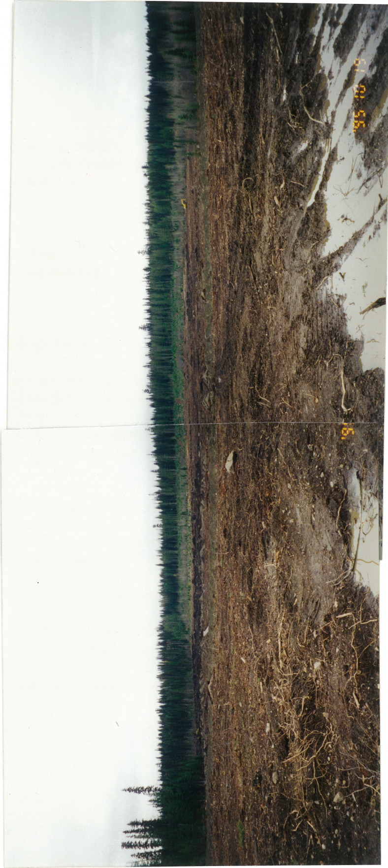
Photo 1 - Looking west across the site of the main dam. The site has been cleared and drainage ditches have been installed. The surface organics have not been removed. Test pits have been backfilled.