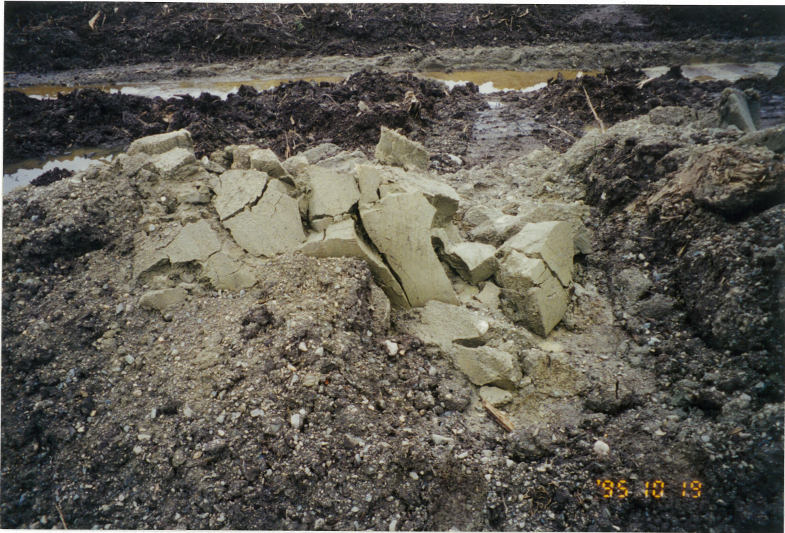
Photo 4 - Excavated medium dense glacial lacustrine clayey sandy silt. This material has medium strength, low permeability and medium-low compressibility.