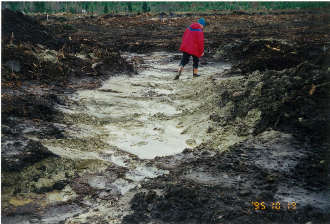
Photo 5 - Glacial till surface exposed by removing organic overburden. The exposed surface is slippery. Prior to placing and fill the surface must be scarified.