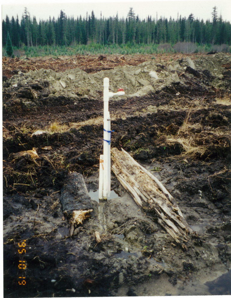
Photo 6 - Piezometer installed with water sampling capability. Toe area of the main dam.