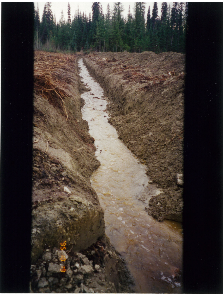
Photo 2 - Ditch excavated to contain a small creek across the site. The southern portion of the ditch is in medium dense to dense glacial till and the southern portion is in glacial lacustrine soils. Note the transition from stable side slopes to ravelling slopes. Easterly end of the dam.