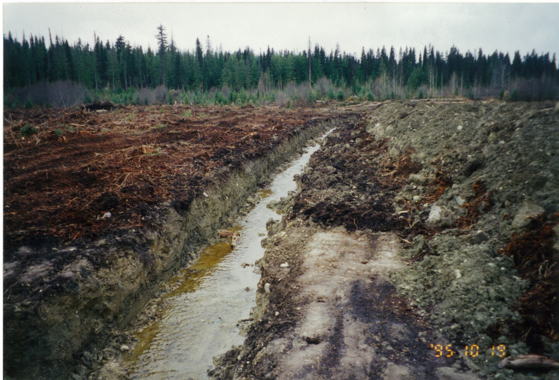
Photo 3 - Looking North along the westerly portion of the dam site. Drainage ditch in glacial till.