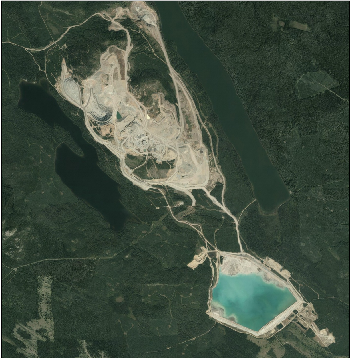
Figure 1.1: Aerial View of Mount Polley Mine Site: October 2013