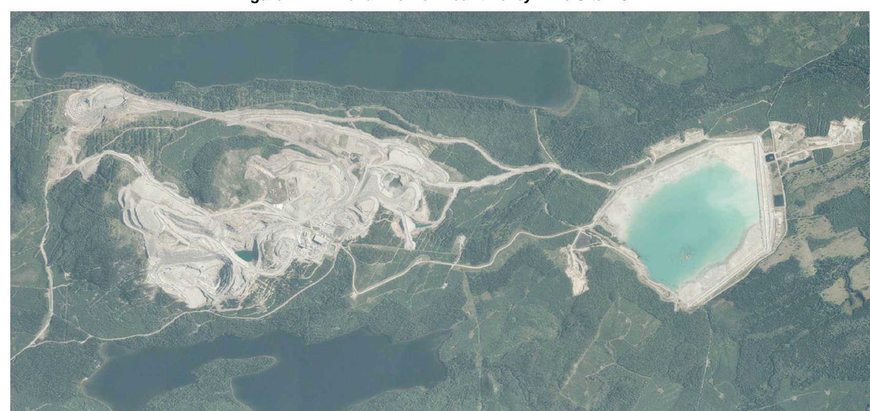
Figure 1.1: Aerial View of Mount Polley Mine Site: 2012