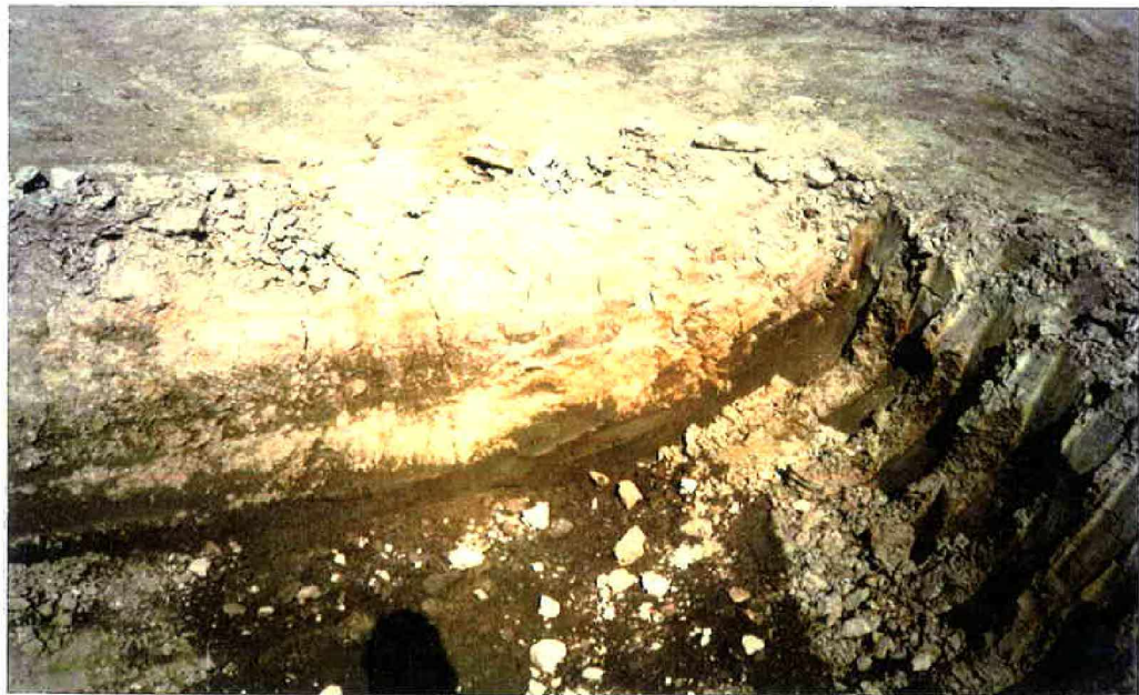
Photo 16. Exploration Trench Near South-West Edge of Basin Liner.