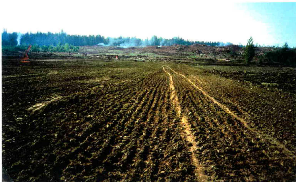
Photo 5. Base of Stage 1b of Main Embankment and Adjoining Basin Liner. Looking South-West.