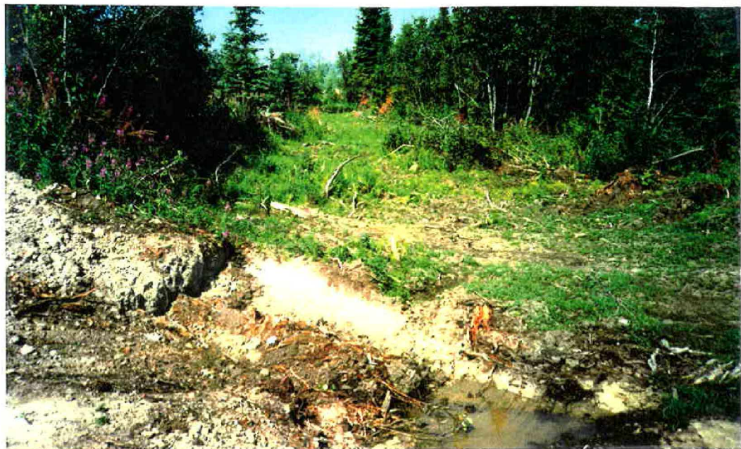
Photo 17. Previous Stream and Trail of Juncture with West Edge of Basin Liner. Looking North-West.