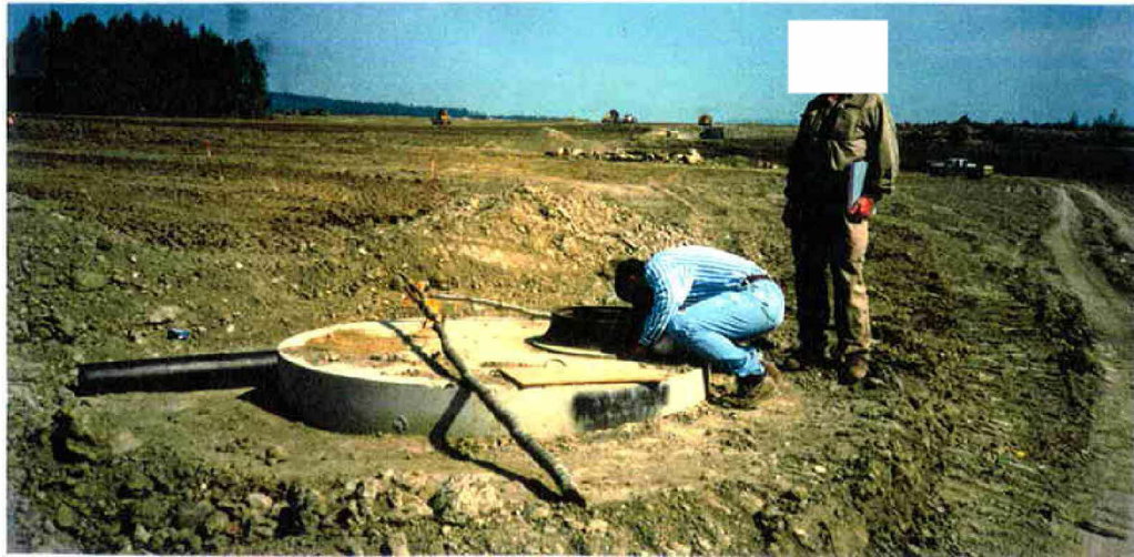
Photo 13. Top of Drain Monitoring Sump at Main Embankment.