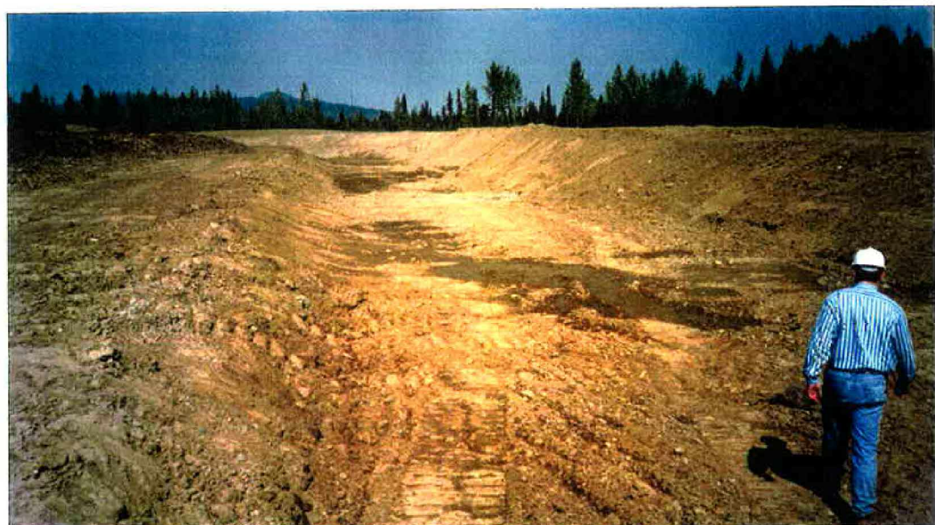
Photo 18. South end of Reclaim Barge Channel. Looking North-West.