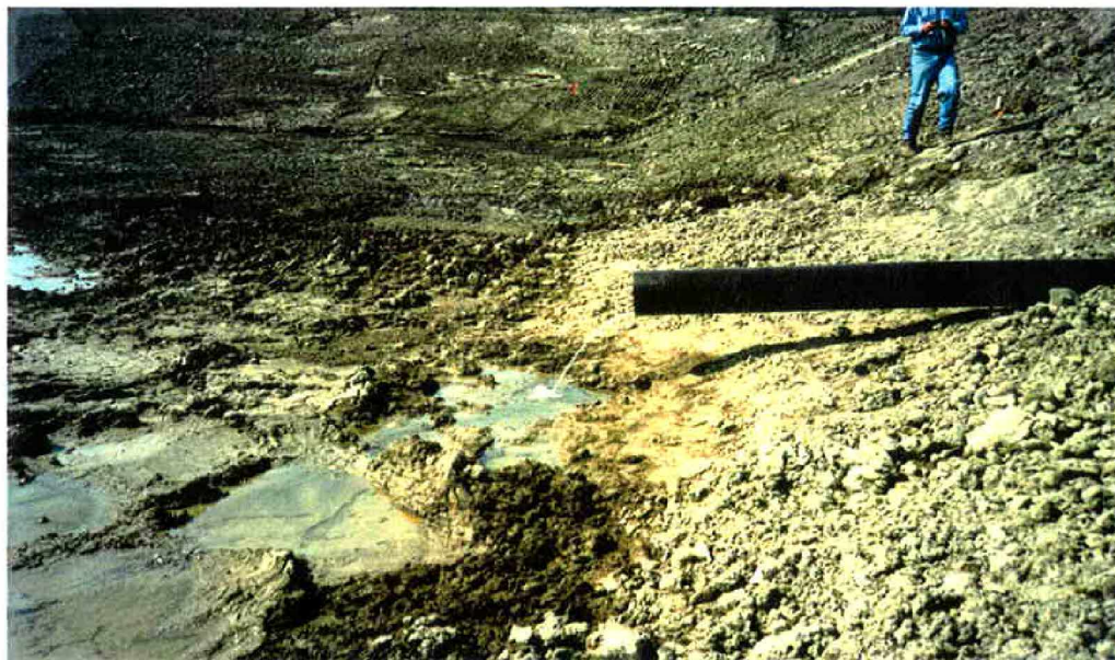
Photo 11. Outlet from Drain Monitoring Sump Discharging into Main Embankment Seepage Collection Pond.