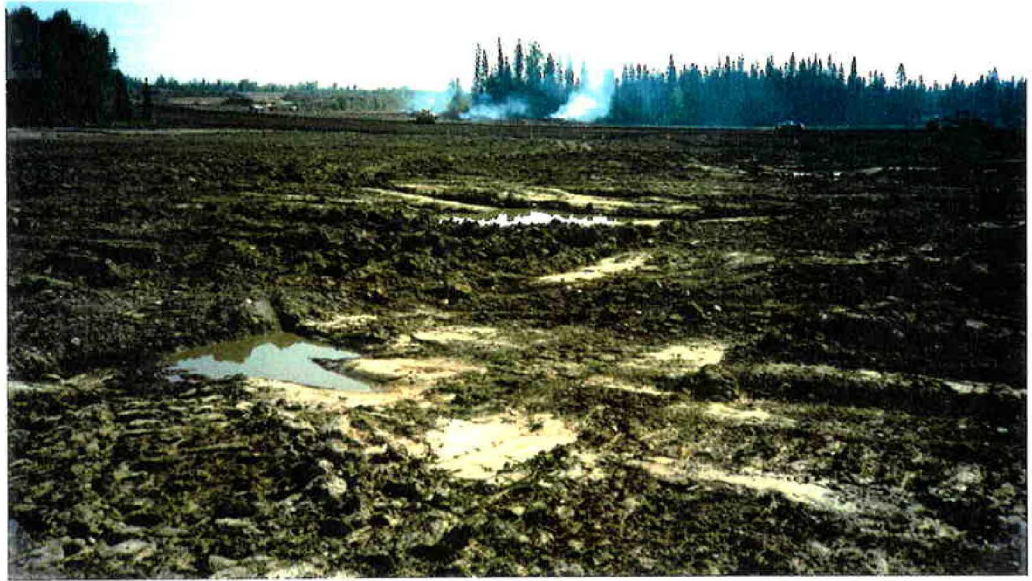
Photo 15. Surface of Basin Liner. Looking East.