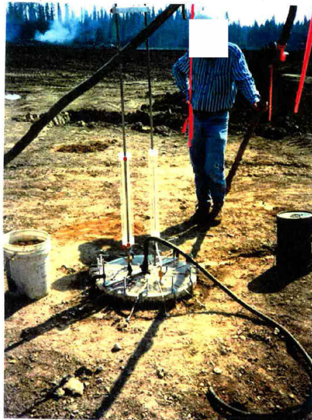
Photo 14. View of Field Air Entry Permeameter Testing of Basin Liner.