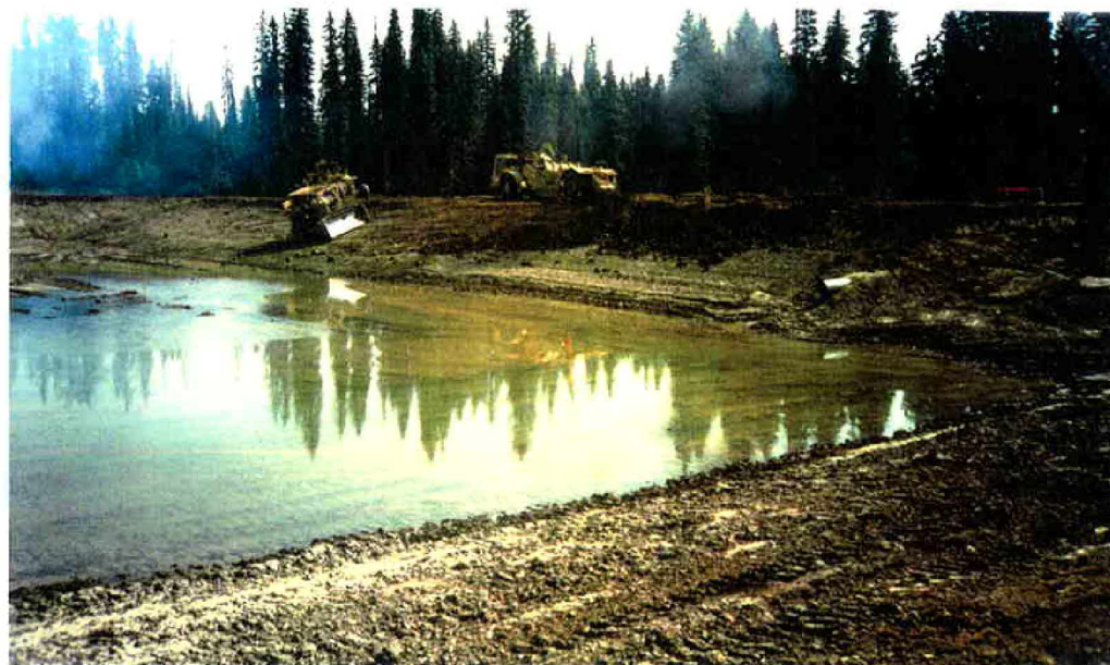
Photo 12. Decant from Main Embankment Seepage Collection Pond in South-West Corner.