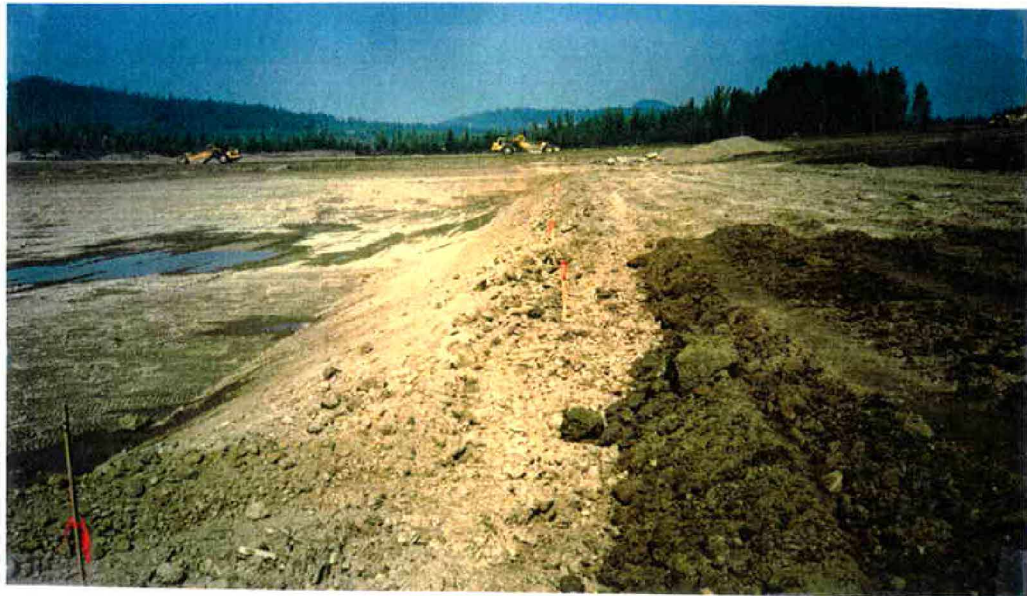
Photo 9. East Side of Main Embankment Seepage Collection Pond. Looking North.