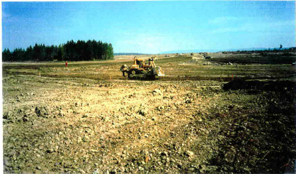
Photo 6. Base of Zone B of Stage 1b of Main Embankment near Seepage Collection Pond. Looking North-East.