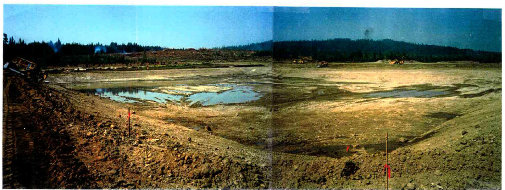
Photo 8. Panoramic View of Main Embankment Seepage Collection Point. Looking West.