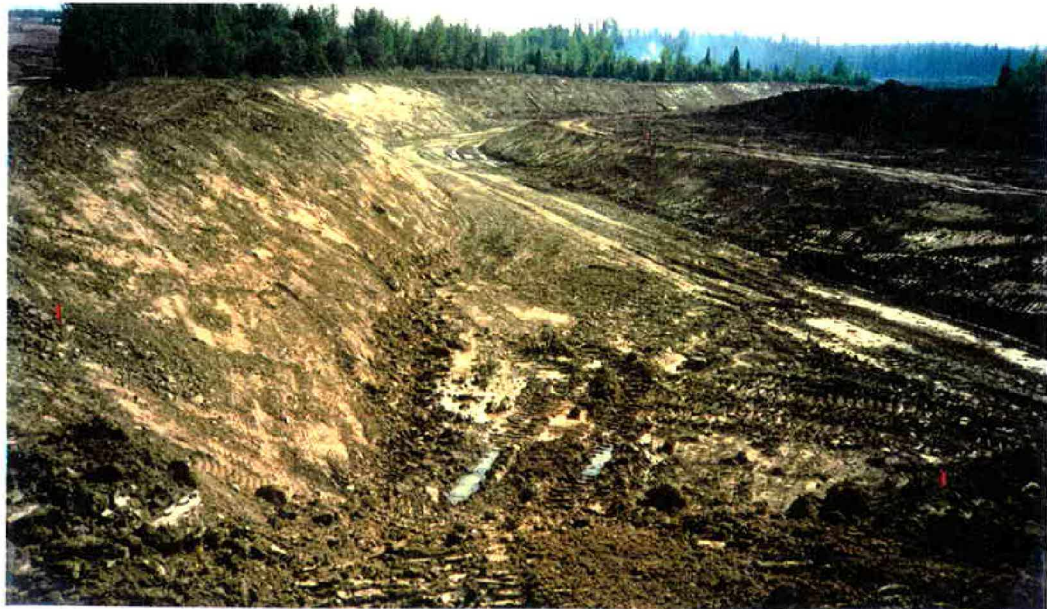
Photo 22. West End of Reclaim Barge Channel at the Time. Looking East Towards Main Embankment.