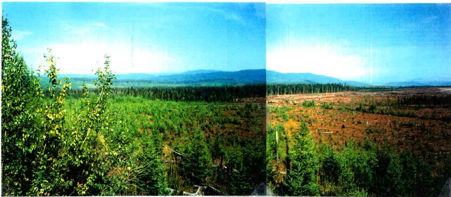
Photo 2. As for Photo 1 but Looking North towards Perimeter Embankment Area