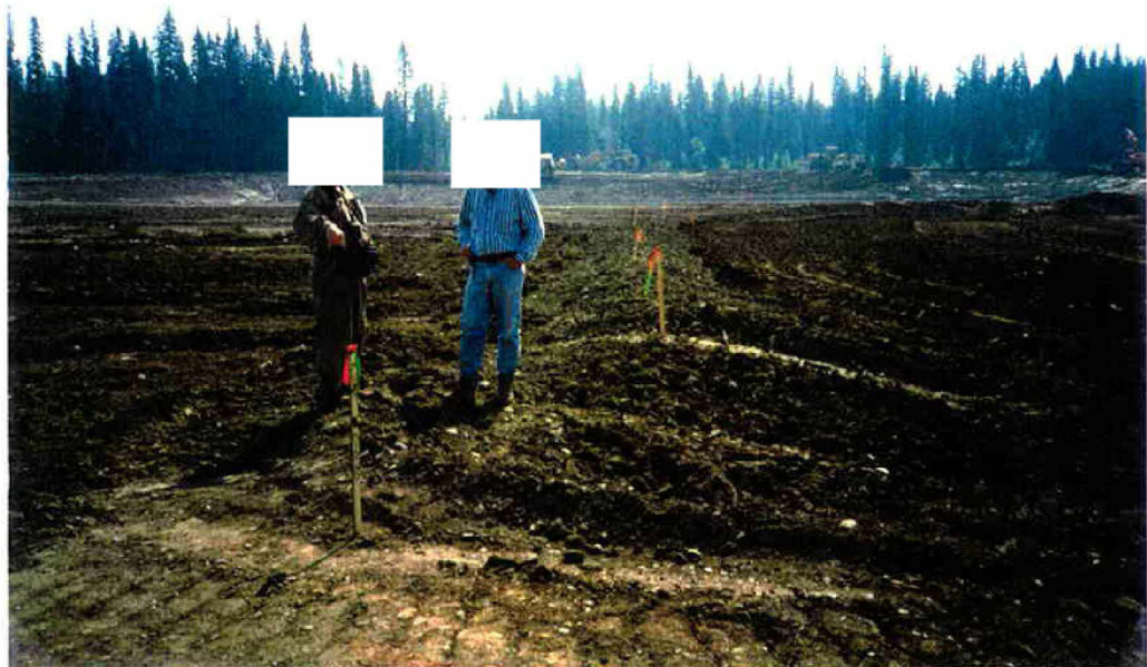
Photo 7. Base of Zone B of Stage 1b of Main Embankment. A Foundation Drain visible. Looking South-East.