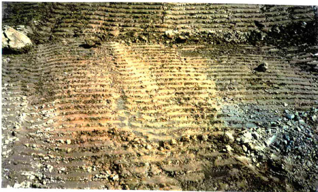
Photo 10. Base of Main Embankment Seepage Collection Pond near South-East Corner.