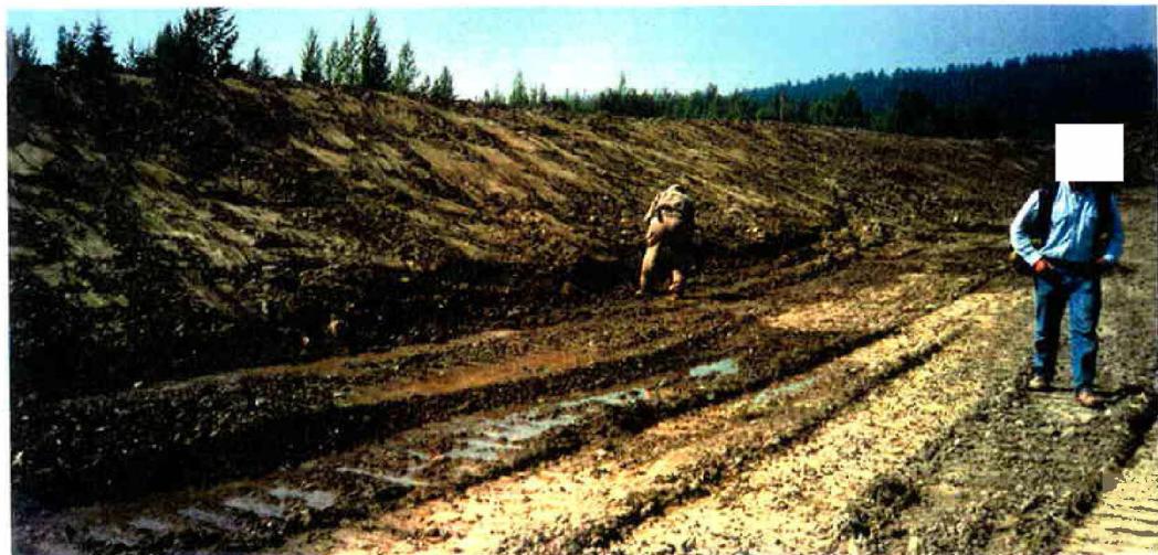
Photo 20. North Side of Reclaim Barge Channel at About Mid-Length.