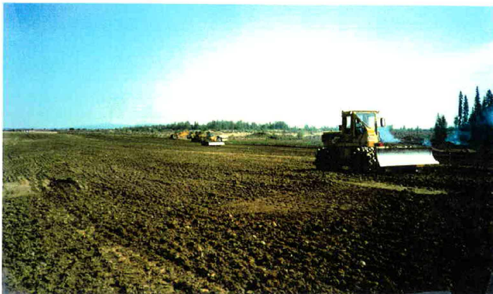
Photo 4. Base of Stage 1b of Main Embankment. Looking South-West.