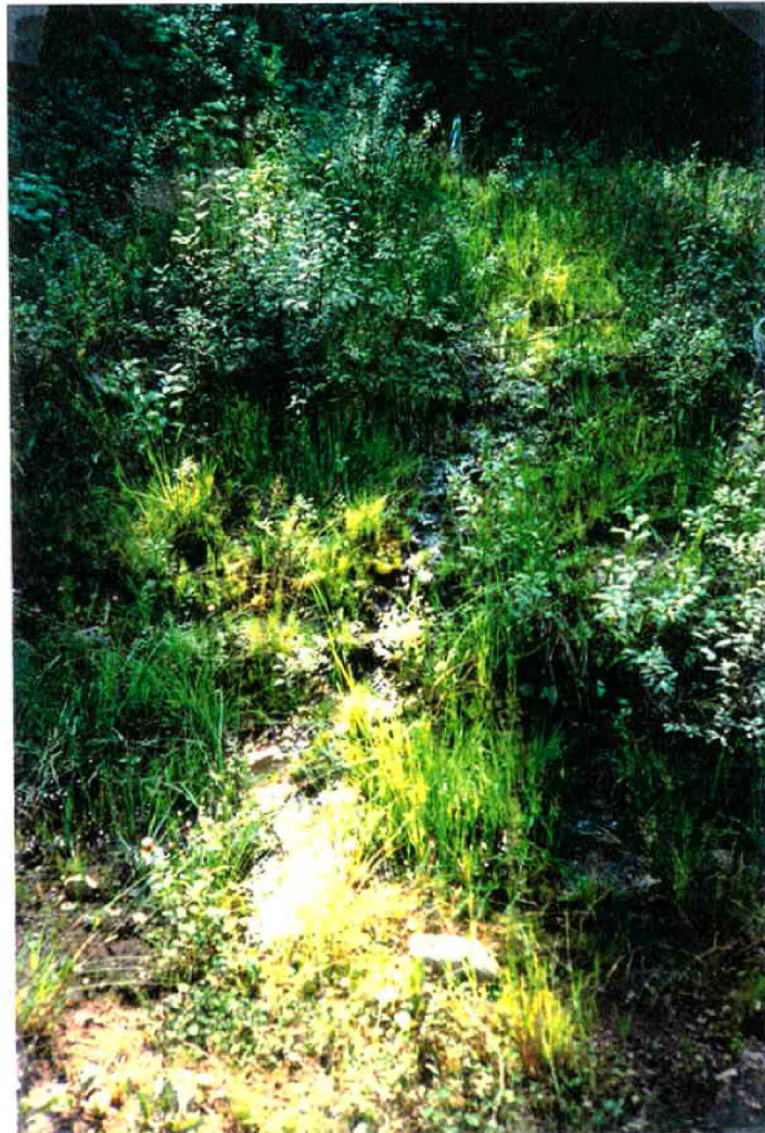
Photo 23. Flow from a Cased Borehole Near Junction of West Perimeter Road and Proposed South Embankment.